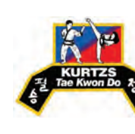
Kurtz's Tae Kwon Do